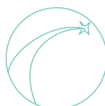
High & low velocity guided & unguided systems