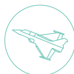
Airborne sensors: • Optronic • Radar • EM